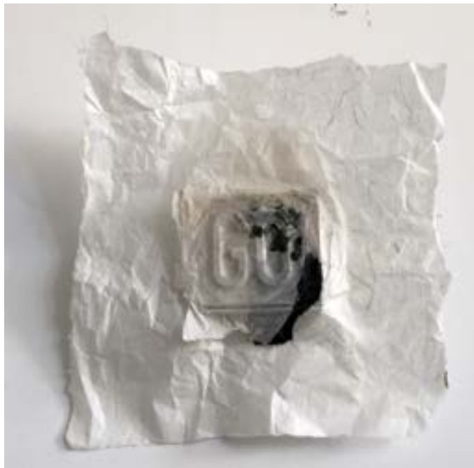
Lin Yan, Go , 2014, ink, xuan paper and wax, 33 x 35 cm.

The tension one senses between Lin Yan's forms—whether realist or abstract, or more correctly, metaphysical (in the Taoist sense)—is inexorable. Her works are identified as having the kind of energy ( qi ) that brings new life into a static space, forms that transfigure the way things appear when they don't really become evident to our senses, when they relinquish their ability to stand out and assume a delicate, strident velocity, an often fierce momentum as they do in the sculptural forms and painting's imagery, often combined as one, as seen in GO (2015) by Lin Yan. Here a simple, yet powerful English word dominates the centrality of a crumpled quadrilateral space, touched