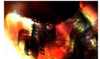
FENG MENGBO L Shot 0281 CHAMBERS FINE ART