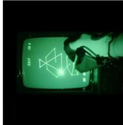
Feng Mengbo Vector Drum , 2013

Now if you go to eBay or somewhere it's very difficult to find. This console was only available for two years so only about 10 games were made. The vector graphics are very special, very different from bitmap.