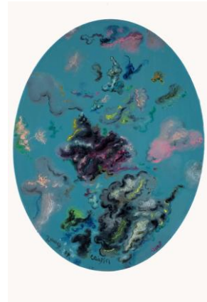
Cai Jin. “Landscape No. 24,” 2009, Oil on canvas, Courtesy of the artist and Chambers Fine Art.

In “Landscape No. 20,” the organic forms occur against a background of brilliant blue. The painted shapes are clearly natural in origin, adding to the viewer’s feeling that s/he is seeing an impression of nature—what we might call its essence—rather than a specifically imagined site or place. “Landscape No. 24” (2009), an elongated ellipse of a painting, contains a series of floating shapes painted onto a blue background. Rendered as cloud-like masses in a broad range of colors, the forms hover gently in mid-air. Cai Jin is at her best when she prefers a roughly improvised arrangement over a meticulously planned composition, and here the forms skate idly by, as if their cumulus shapes were being powered by the wind.