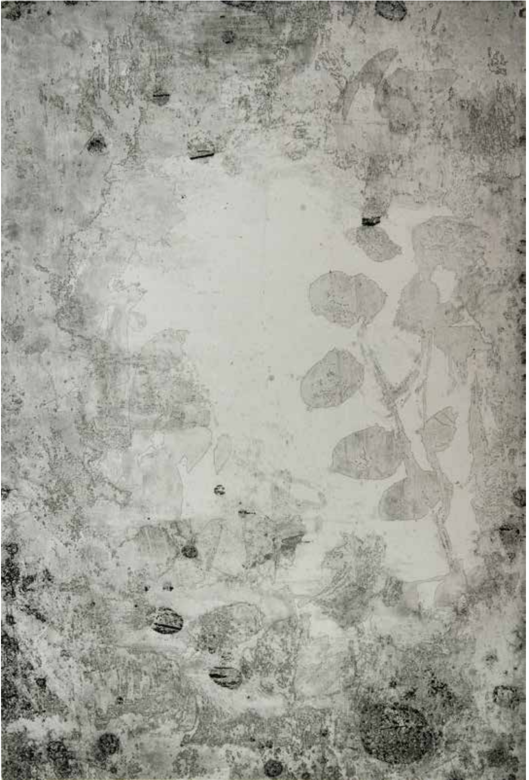
Yan Shanchun, West Lake–Yanggong Causeway 02 , copper plate etching, 29 x 20 cm.