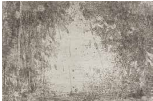
Yan Shanchun, West Lake-Ge Hill , 2013, copper plate etchings, set of 4, 13 x 20 cm each.