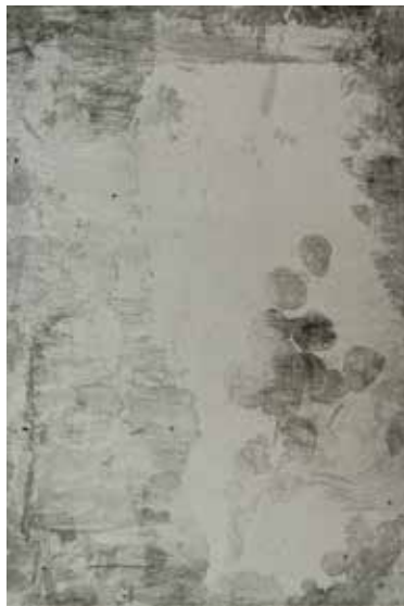
Yan Shanchun, West Lake–Yanggong Causeway 03 , 2014, copper plate etching, 29 x 20 cm.

of collotype reproductions of works by Zhao Zhiqian (1829–1884), published between 1918 and 1928, that left an indelible impression on him. He says that he greatly admired the quality of the printing and how it succeeded in conveying the full range of tonal subtlety, and still carries it in the back of his mind when he prints his own etchings. Yan Shanchun has given an eloquent summary of the effect he is trying to achieve: “The effect is very similar to collotype printing which I adore, and the effect is similar to the