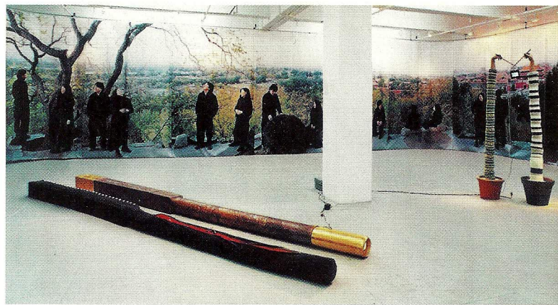
View of Song Dong and Yin Xiuzhen's Chopsticks (foreground), United Hands (right), and Life (background), all 2002; at Chambers Fine Art.