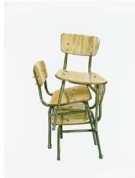
Guo Hongwei

Guo Hongwei Biography 1982 Born in 1982 in Sichuan, China 2005 Bachelor of Fine Arts, Sichuan Fine Arts Institute - Department of Oil Painting Lives and works in Beijing, China Selected Exhibitions 2009 "VIVA! New Art. New Visions", Connoisseur Contemporary and Connoisseur Art Gallery, Hong Kong 2009 Scope Basel, Basel, Switzerland 2008 Group Exhibition with 82 Republic in SH Contemporar... (more)