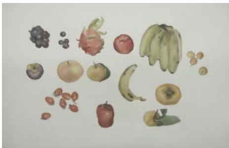
My Healthy Diet No.2 (2009) Watercolor on paper

This is a sensitive and fundamental question. It is really determined by an artist's individual ways and means of resolving this issue, not from the outside world. (i.e. social and cultural factors).