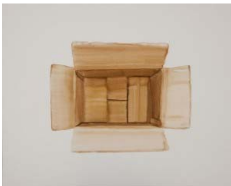
Empty Space (2010) Oil on Canvas

March 30, 2010 by Katherine Don no comment