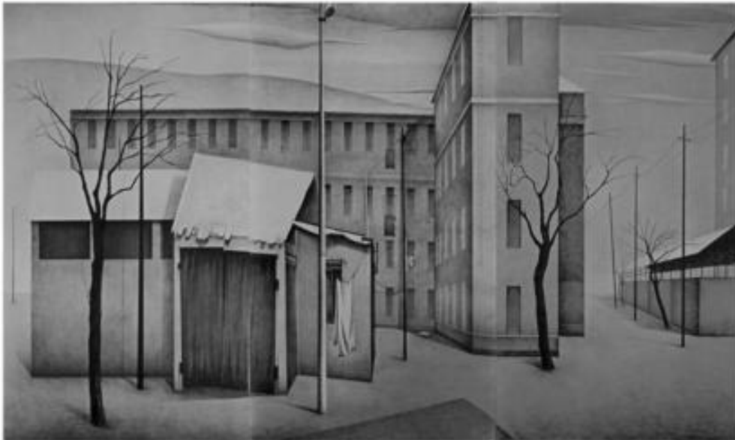
ZHANG DUN , Street Scene No. 6 , 2011, pencil on paper.

Web Review BY Drew Ford Chambers Fine Art