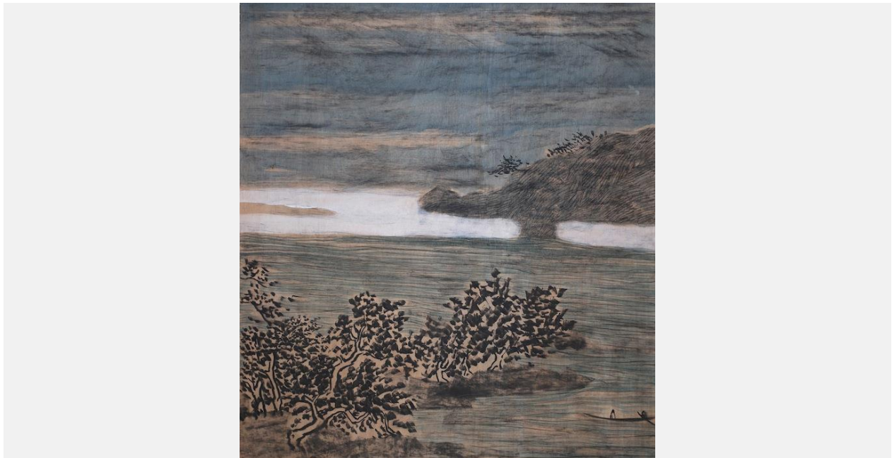
Lam Tung Pang, 'Land Escape (23)', 2013, acrylics and charcoal on plywood, 110 x 100 cm.

Her works have been included in collections locally and internationally, such as at the Hong Kong Museum of Art, Hong Kong; New Taipei City Yingge Ceramics Museum, Taiwan; and Burger Collection, Switzerland.