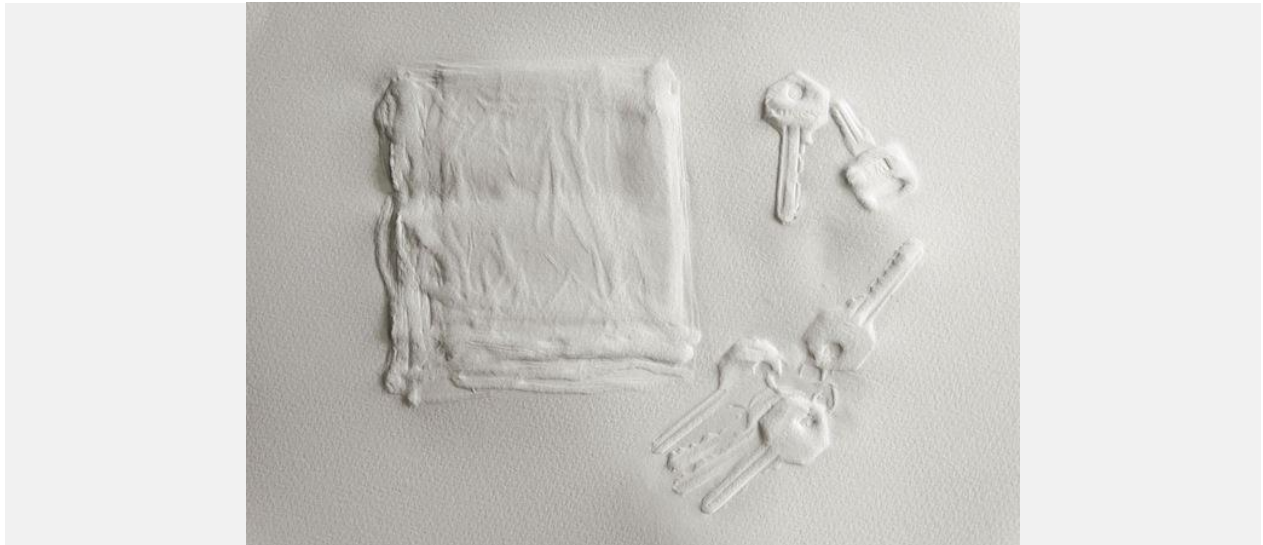
Wan Lai Kuen, Annie, 'Lost in Daily Life (3)', 2017, relief print, paper, 56 x 76 cm.

Art Radar takes a look at the unique production process of the nine Hong Kong artists and speaks to each of them to find out more about their work.