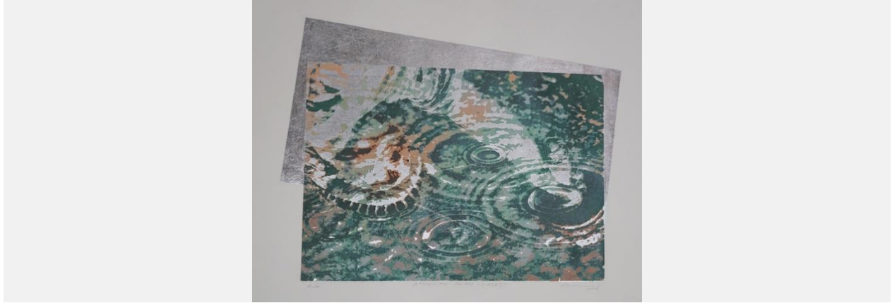
Chung Tai Fu, 'American Dream: Liberty', 2016, screen print, mineral pigment, 35 x 45 cm.