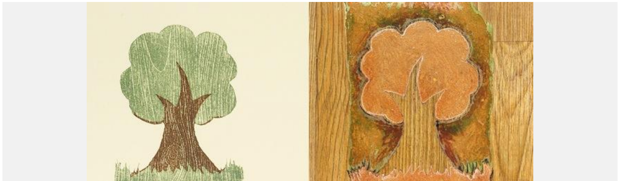
Ling Chin Tang Parry, 2016, woodblock print: vocabulary card, relief print, 60 x 150 cm, Image courtesy the artist and Sun Museum.

His works have been exhibited widely including at Saatchi Gallery, London; Liverpool Biennial; and at Asia Society, Hong Kong.