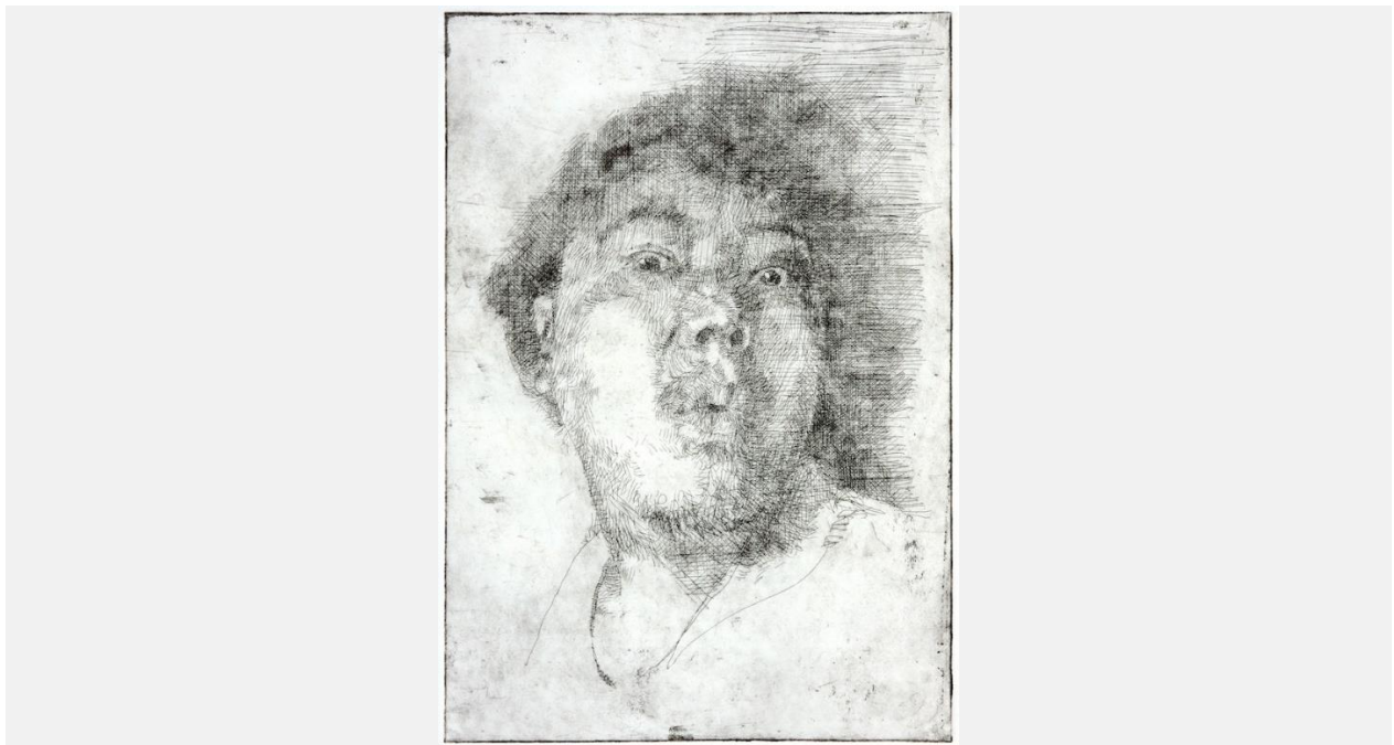
Chow Chun Fai, 2016, a self-portrait made with optical device on a metal plate coated with black anti-corrosion etching, 25.5 x 18 cm.