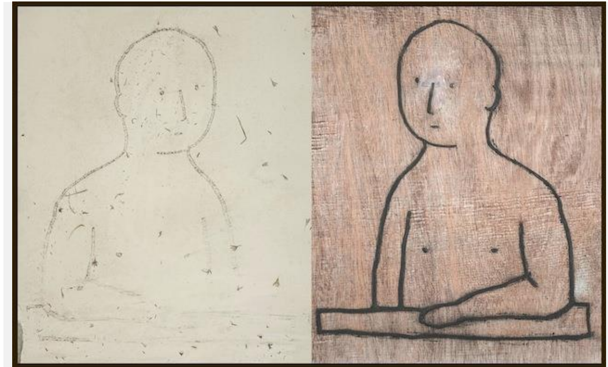
Lam Tung Pang, 'Two Sides of One Body (1)', 2016, charcoal on handmade paper and wooden panel, 45 x 74 cm.

The exhibition draws attention to the medium of printmaking, which is neglected in Hong Kong in favour of ink painting and installation art amidst the current art scene. Art Radar finds out more about the work of the artists on show.