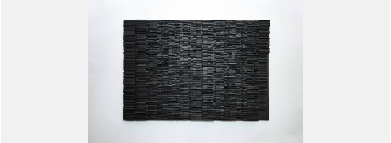
Chan Yuk Keung Kurt, 'The First Chant of Diamond Sutra', 2016, 3D printing, polyamide, 30 x 57 cm, Image courtesy the artist and Sun Museum.