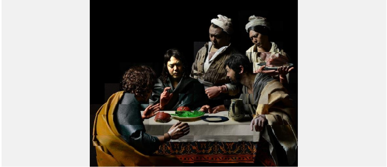
Chow Chun Fai, 'Supper at Emmaus', 2014, photo installation, 142.4 x 177.8 cm.

Centre, Manchester, UK; Tate Modern , London; Royal College of Art, London, and included in collections such as M+ Museum , Hong Kong; Burger Collection, Hong Kong; K11 Art Foundation , Shanghai; and Deutsche Bank, Frankfurt, Germany.