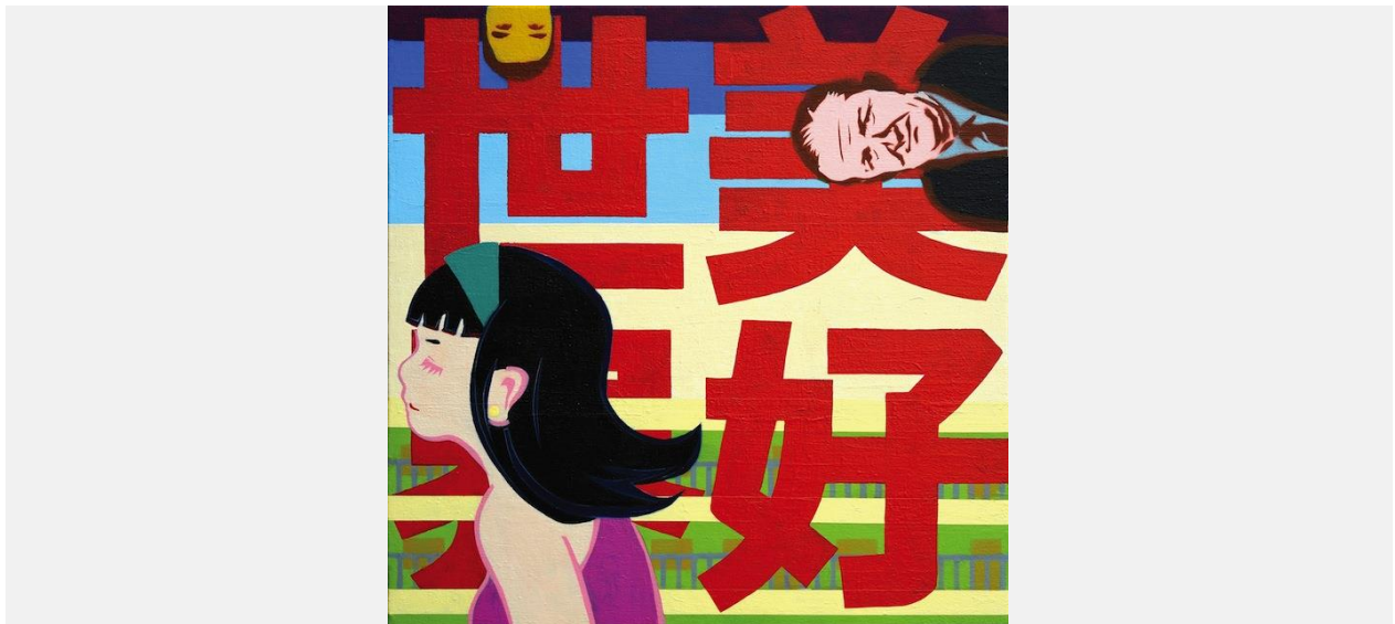
Tse Yim-On, 'Wonderful World (1974-2)', 2016, relief print, acrylic on canvas, 60 x 60 cm.

I chose subject matter that are symbolic and transform them into complex concepts. In terms of material and technique, those in this show are different from what I usually use. I love the colours and layering of mineral pigment, as well as the elegance conveyed by gold leaf. However, it is difficult to apply them with the gravure technique that I normally use. Hence, I change it to silk-screen printing this time. I'm not completely satisfied with the result, especially with the way the mineral pigment is shown. Yet this experimental process contributes to two changes: I used to work in black and white, now it is colourful. Secondly, my works used to be about my inner feelings, now it is a reflection of the material world. The use of mineral pigment on screen print greatly increased the versatility in the printing process.