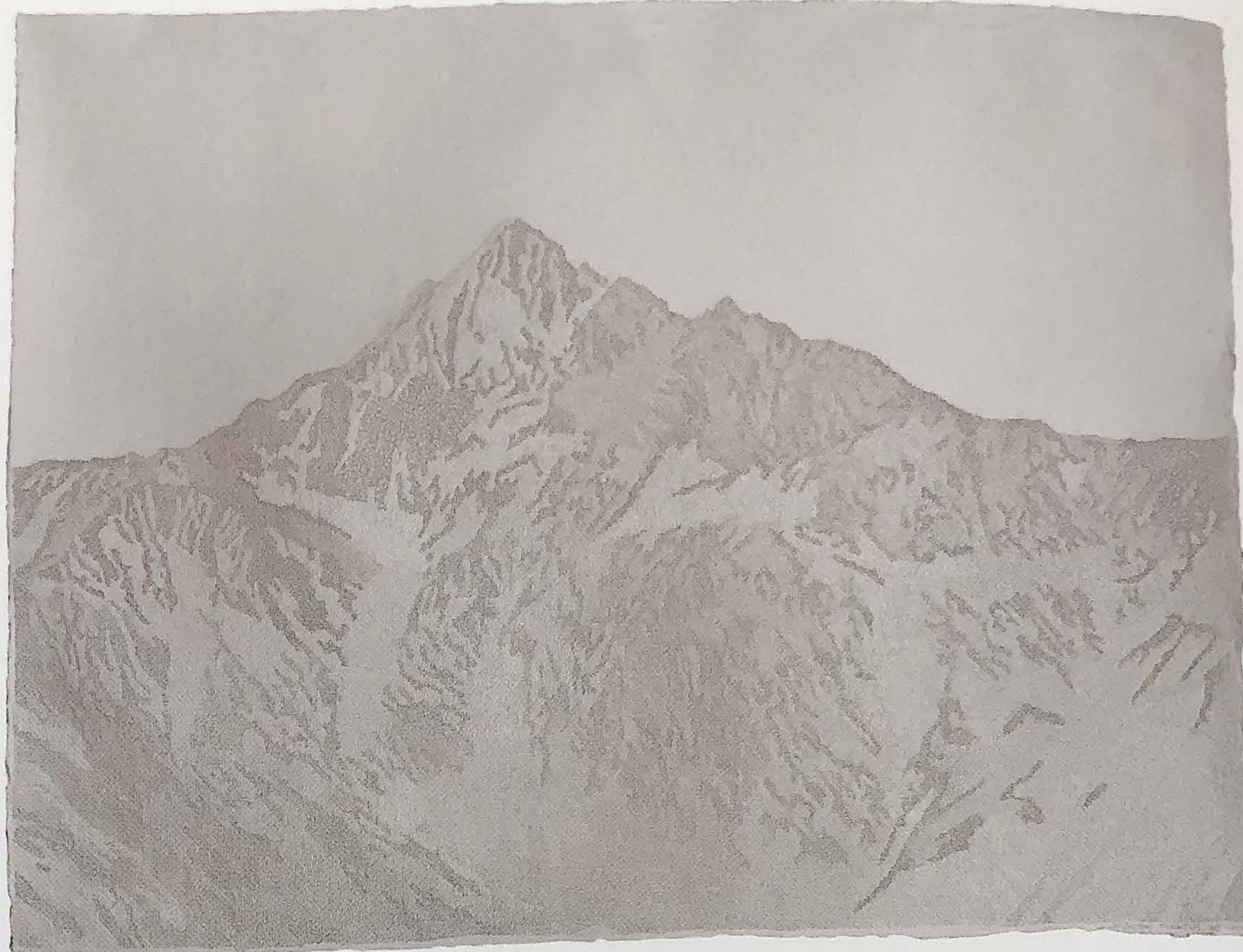
604,800 Holes, 2015. Handpaper, 100 x 76cm.

Fu's piercing of Xuan paper is in many respects a reversal of techniques associated traditionally with wenrenhua . Instead of applying ink to paper she intervenes negatively, disrupting its very fabric. In place of veiling additions through assured application of line, multiple absences are formed by an obsessively measured accumulation of piercings whose meticulousness is more redolent of gongbi than xieyi painting. Spontaneity and individuality give way to a resolutely non-expressive interruption of the integrity of the paper's surface. Depiction arises not as a setting out of additive signifiers but as an effect of material disruption. Repetitive piercing by needles—traditionally women's work—is used to displace (to subtract from and exceed) the additive covering of paper by ink associated with the masculinist Confucianism of China's historical scholarship. Representation, while consonant with traditional shanshui subject matter, is revenant. Its appearance is immaterial, at once replete with significance and void ('the nothingness of images'). Rather than