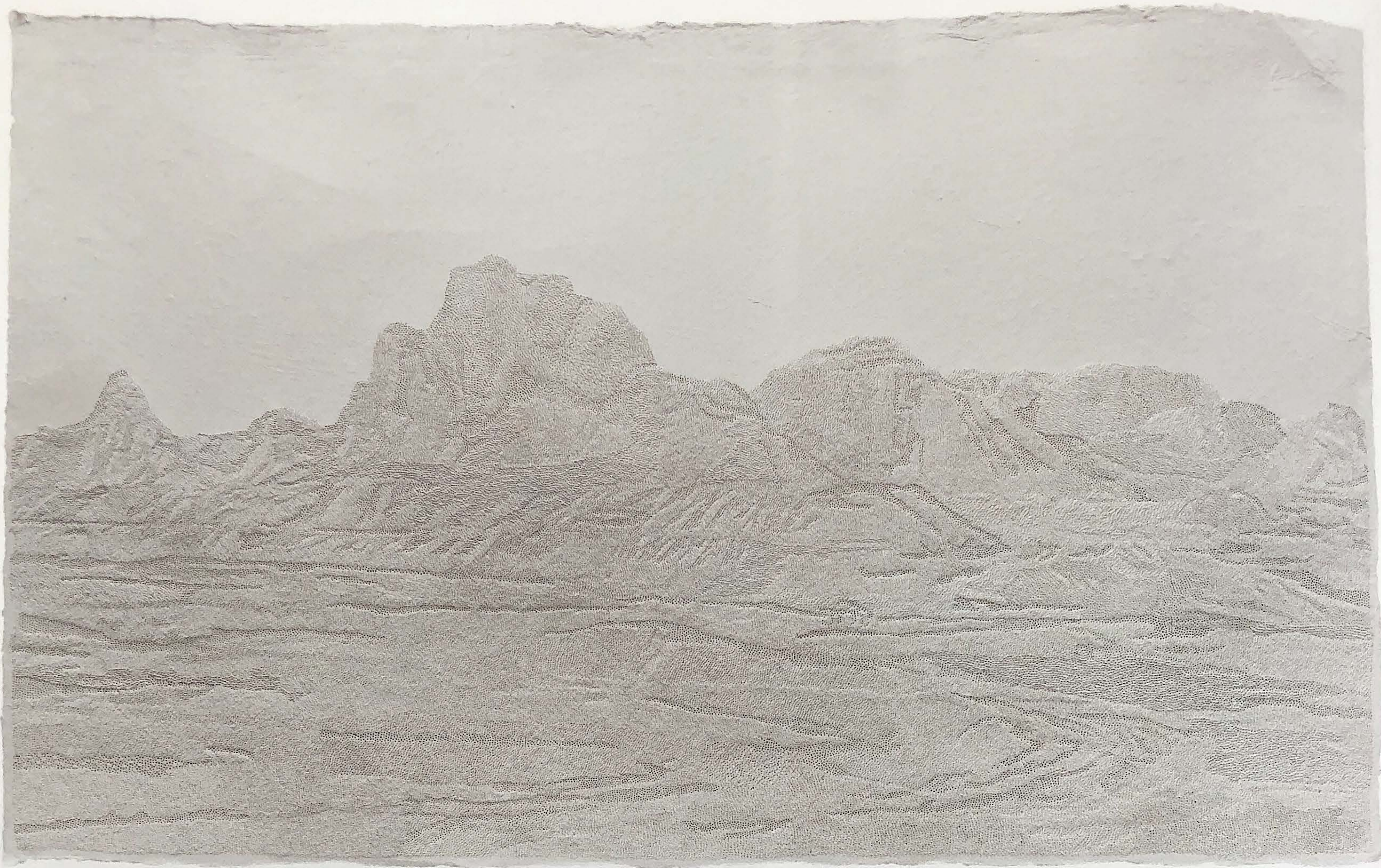
578,700 Holes. Handpaper, 116 x 72cm.