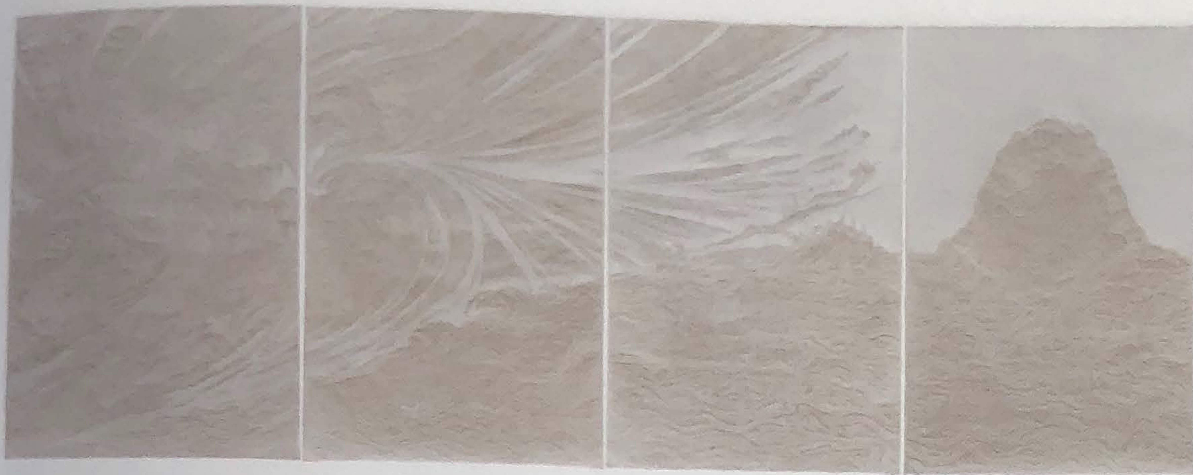
The wind 1-4, 2015. Handpaper, 250 x 640cm. Courtesy the artist.

symbolic) that is both the conditional substratum of a supposedly phallogocentric linguistic symbolism and at the same time the latter's radical other. 5 In his short essay Khôra , 6 Jacques Derrida uses the term to identify the site of the differentiation between being and non-being, which comprehends the possibility of that differentiation while simultaneously resisting identification simply as one or the other. For Derrida, khôra can thus be understood to defy the binary logic of linguistic naming. As such, its own naming may be taken as a supplement to Derrida's coining of the term différance , which he uses to performatively signify a persistently deconstructive movement of differing-deferring between signs upon which the very possibility of linguistic meaning is conditional. 7