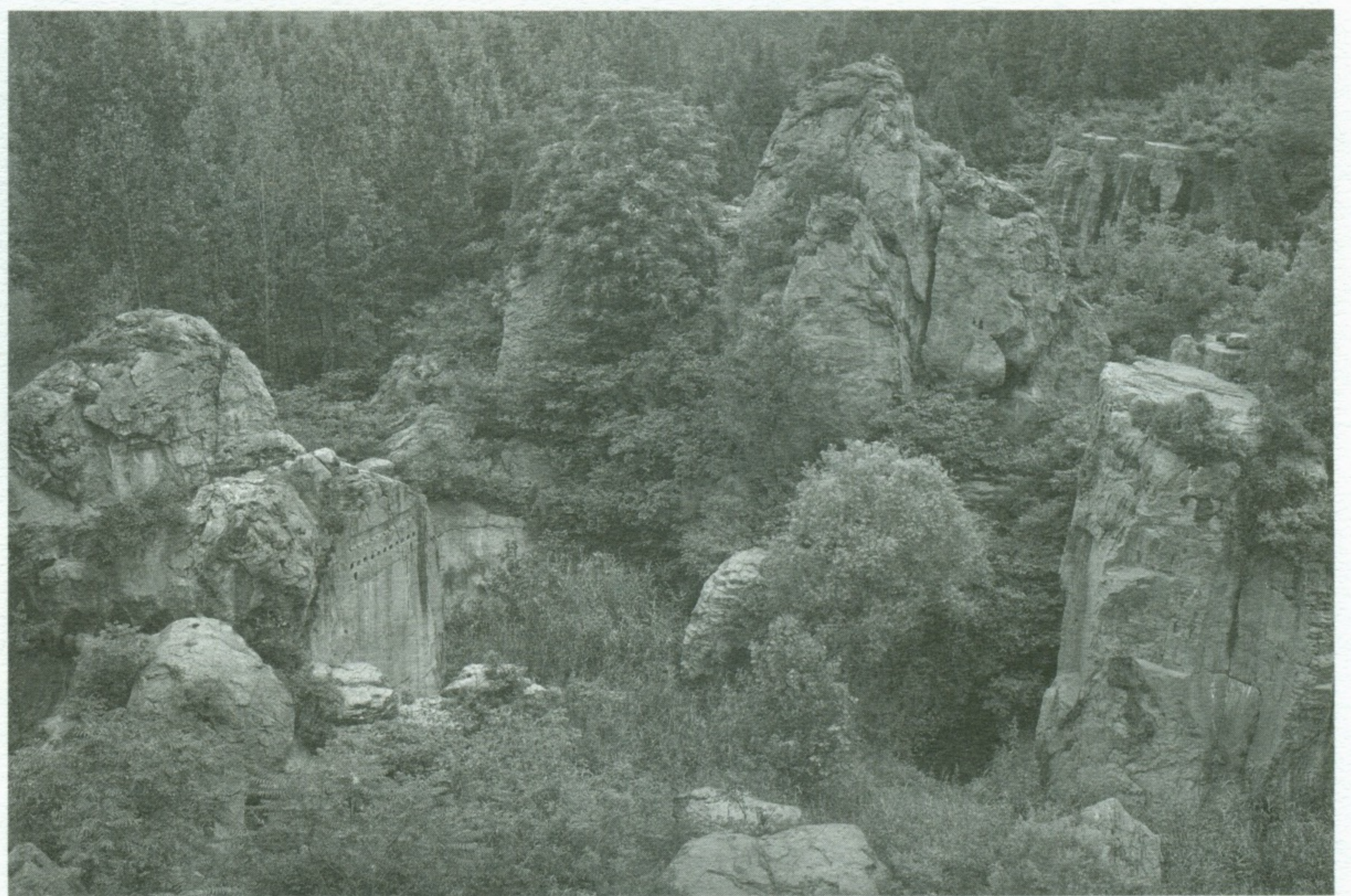
Taca Sui, Shicong , 2015, archival pigment print on baryta paper, 53 x 80 cm.

Taca Sui's photographs are direct inheritors of this search for identity in the physical relics of the past. However, a direct connection with antiquity is impossible to construct using Huang Yi's methods. Following Huang Yi's footsteps through the landscape of contemporary China, Taca Sui has been largely unable to find ancient steles, making documentation of these sites through the production of taben impossible. Even when he does find steles, their faces are worn blank from weathering and cracked with damage. These surfaces resist mechanical reproduction through rubbing, conveying layers