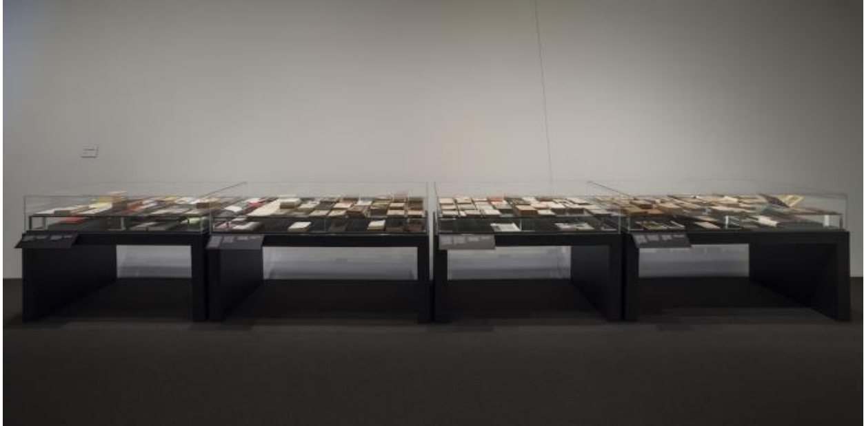
Xiaoze Xie, "Objects of Evidence (Modern Books)" (2017), mixed-media installation, (photo by Jeff Wells, courtesy of the Denver Art Museum, Chambers Fine Art and the artist)

the Republic (1911-1949), the 1950s, the Cultural Revolution (1966-1976), and from 1980 to 2010. The top shelf of the display case has stacks of first editions. The books published during the Cultural Revolution, include hand-copied volumes, commonly called yellow cover or gray cover books, Western literature, and books by authors who did not conform to the party's politics, and thus were labeled "poisonous weeds." Below that glass shelf another display of books echoes the ones above or fill in its gaps with second editions. These editions were printed outside or inside China after the prohibition was lifted. By finding first editions and second editions for comparison, Xie could isolate a single sentence that was removed or find the causes for censure.