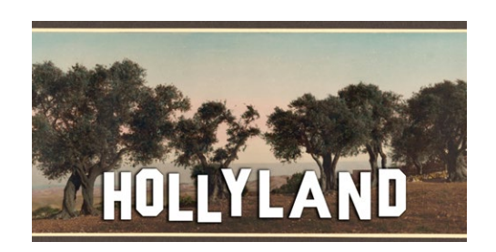
Slow and Steady

Opening sales pick up after a slow start, revealing a robust local offering