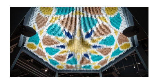
Islamic Art with a Contemporary Twist

The new Al Burda Endowment showcases the latest talent at ADA