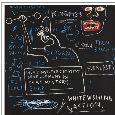
Jean-Michel Basquiat, Rinso , 1985. Printed in 2001. Screenprint on museum board. 40 x 40 inches. Edition 19/85.