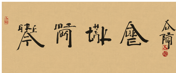
Xu Bing, Square Word Calligraphy: Great Minds Think Alike , 2020. Ink on paper. 10.6 x 26.3 inches. ©Xu Bing Studio