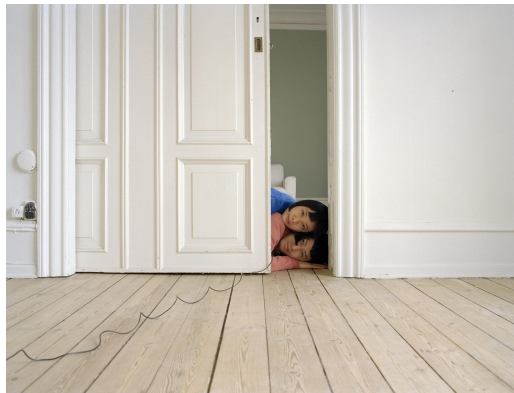
Pixy Liao, Door Stopper , 2017. Digital C-print. 15 x 20 inches