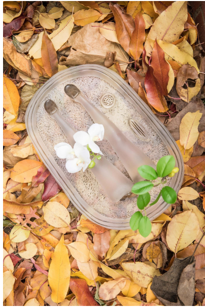
Meng Du, Breathing , 2019. Kiln-formed glass, silver foil, mixed media. 13 \frac{3}{8} x 9 \frac{1}{4} x 8 inches. Photograph by Peichao Lin ©Meng Du, courtesy of Fou Gallery