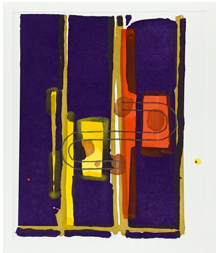
Matt Connors, Without Title 4 , 2019. Handcoloured aquatint. 20.9 x 18.9 inches. ©Matt Connors