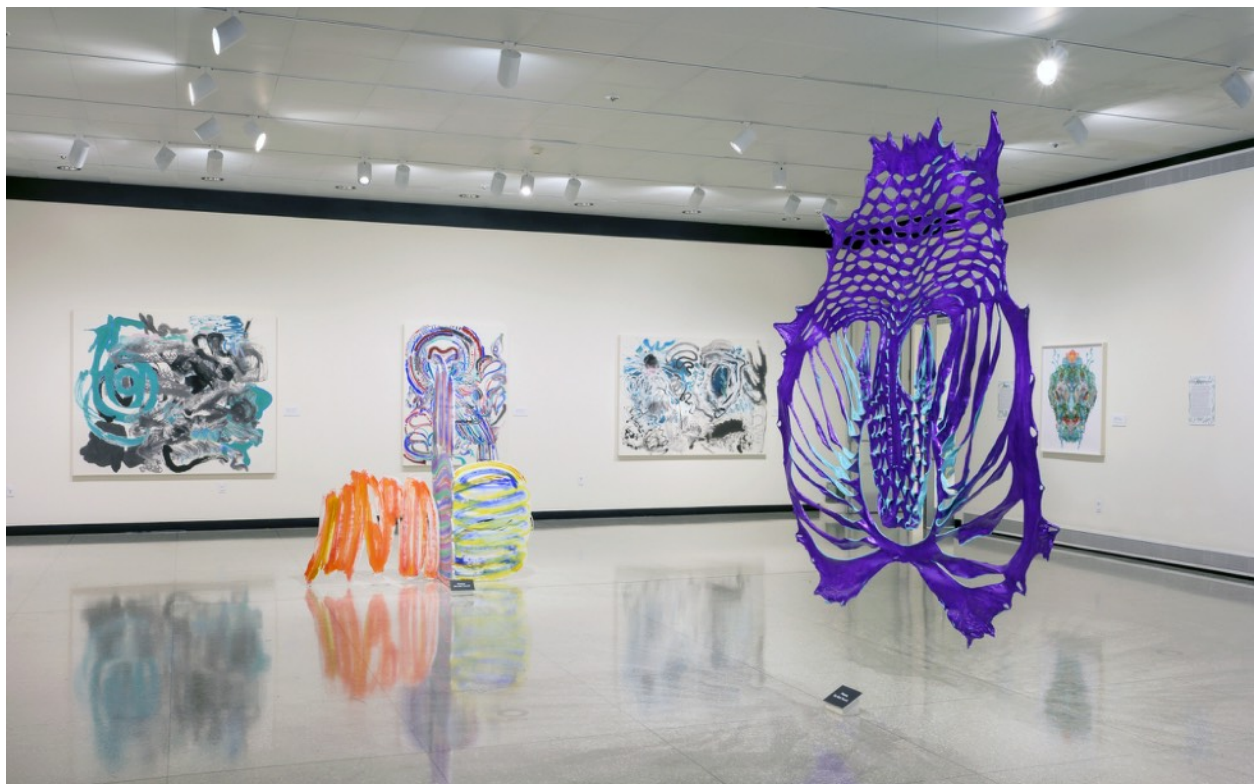
Installation view: A Bridge Between Two Worlds

A Bridge Between Two Worlds: Works by Wu Jian'an is the first major museum exhibition featuring the artist's incredibly meticulous work in the United States. Operating across a variety of media, Wu Jian'an is a unique figure in the contemporary Chinese art world. Although the artist's primary medium is cut paper, over the course of his career, he has expanded his practice to include working in painting and sculpture. The exhibition features a variety of objects demonstrating the artist's creative evolution over two decades. Frequently, the artist's complex and multi-layered compositions include thousands of elements that reference contemporary, mythological, and obscure folklore. Wu Jian'an work has been referred to as a hybrid of past and future, figure and abstraction, and tradition and innovation.