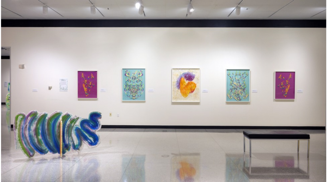
Installation view: A Bridge Between Two Worlds