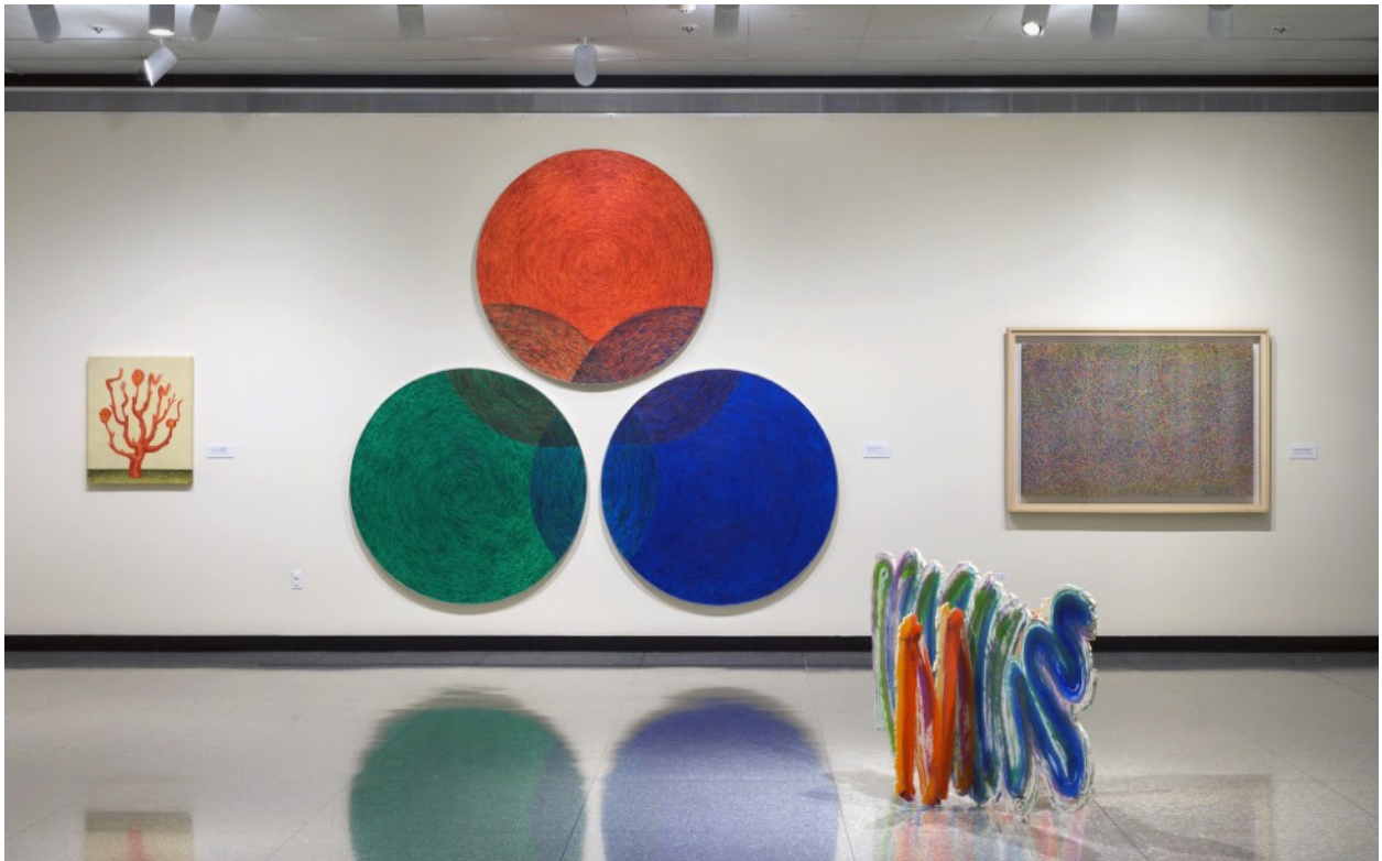
Installation view: A Bridge Between Two Worlds